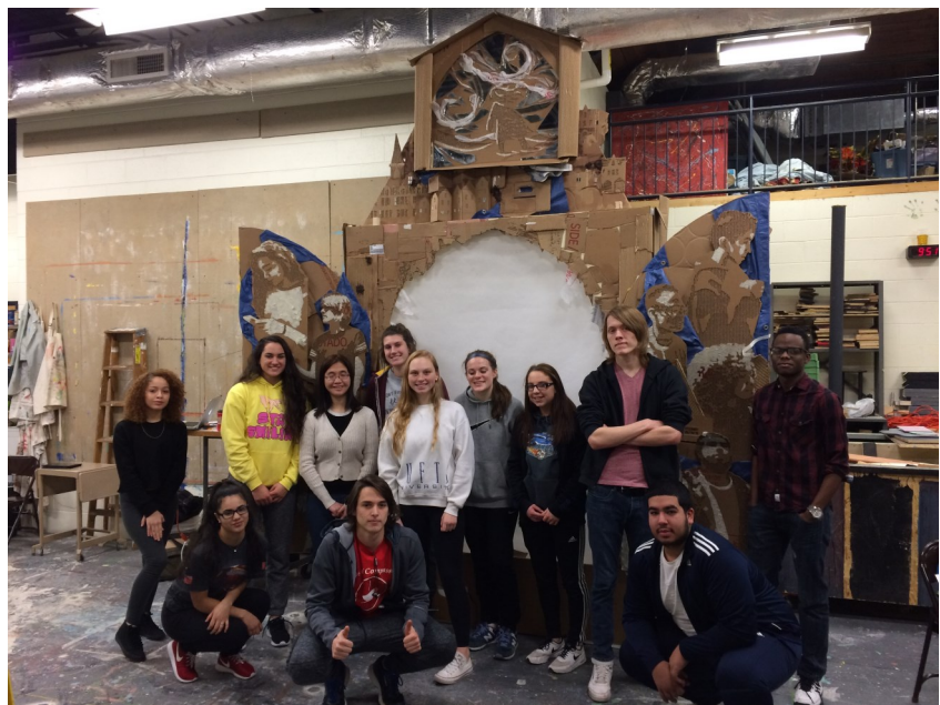
Public Art Workshop students display their work for the Little Matchgirl Passion .